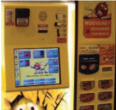
Libert-e adapted the front of a branded refrigerated Mars candy machine, adding a telephone card vending machine. The payment systems for the telephone card machine is separate from the candy machine.