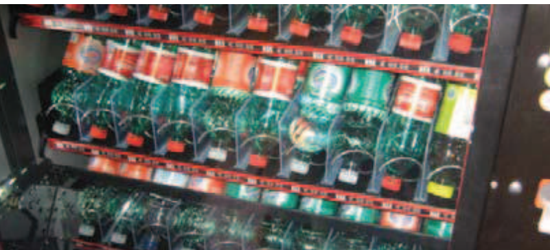
Bottles are displayed and dispensed top down in glassfront machines.

package features top and bottom susceptors that allow the products to be grilled from both above and below. The company is relatively new in the vending channel. Entering vending was seen as an opportunity to expand brand presence and increase sales in a channel where the brand gets directly to the customer. The opportunity here is simple — deliver a better product using technology to offer shoppers something better than what is available now.